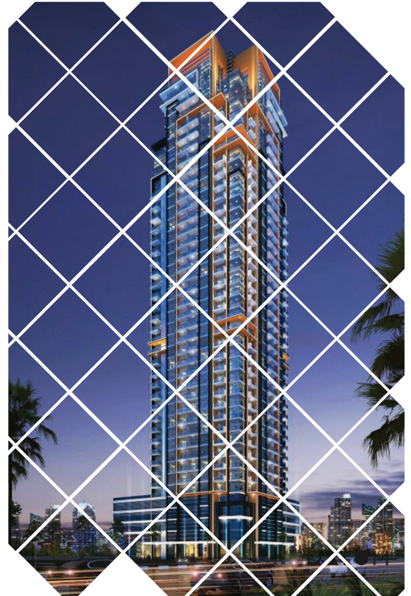
Datum Tower Dubai